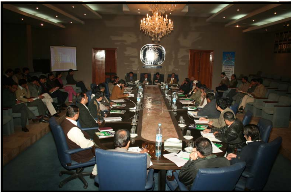
Participants of the Seminar on "Impact of the WTO Regime on Sports Goods and Surgical Instruments Industries of Pakistan" Organized by the WTO Cell, P&D Department in collaboration with Sialkot Chamber of Commerce and Industry.